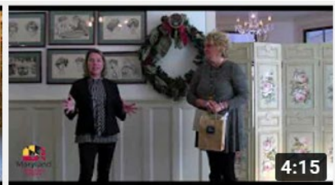
Visit Berlin This Winter!