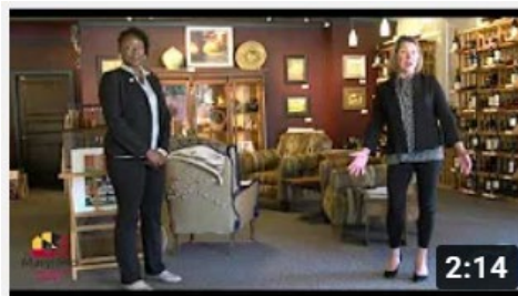
Snow Hill Holiday Happenings!