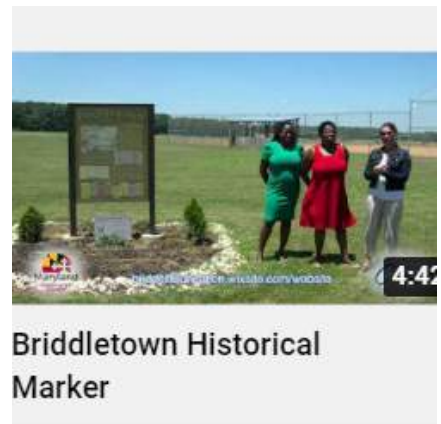
Bridletown Historical Marker